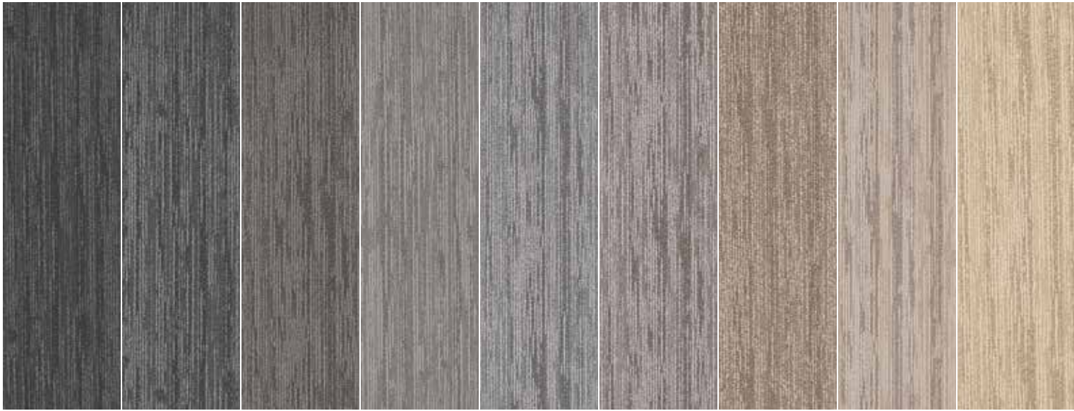
MALMO ZAIDE 100 MALMO JETTE 200 MALMO NIRI 300 MALMO MAJA 400 MALMO KARLA 500 MALMO RAKEL 600 MALMO ANNELI 700 MALMO GALA 800 MALMO DANA 900